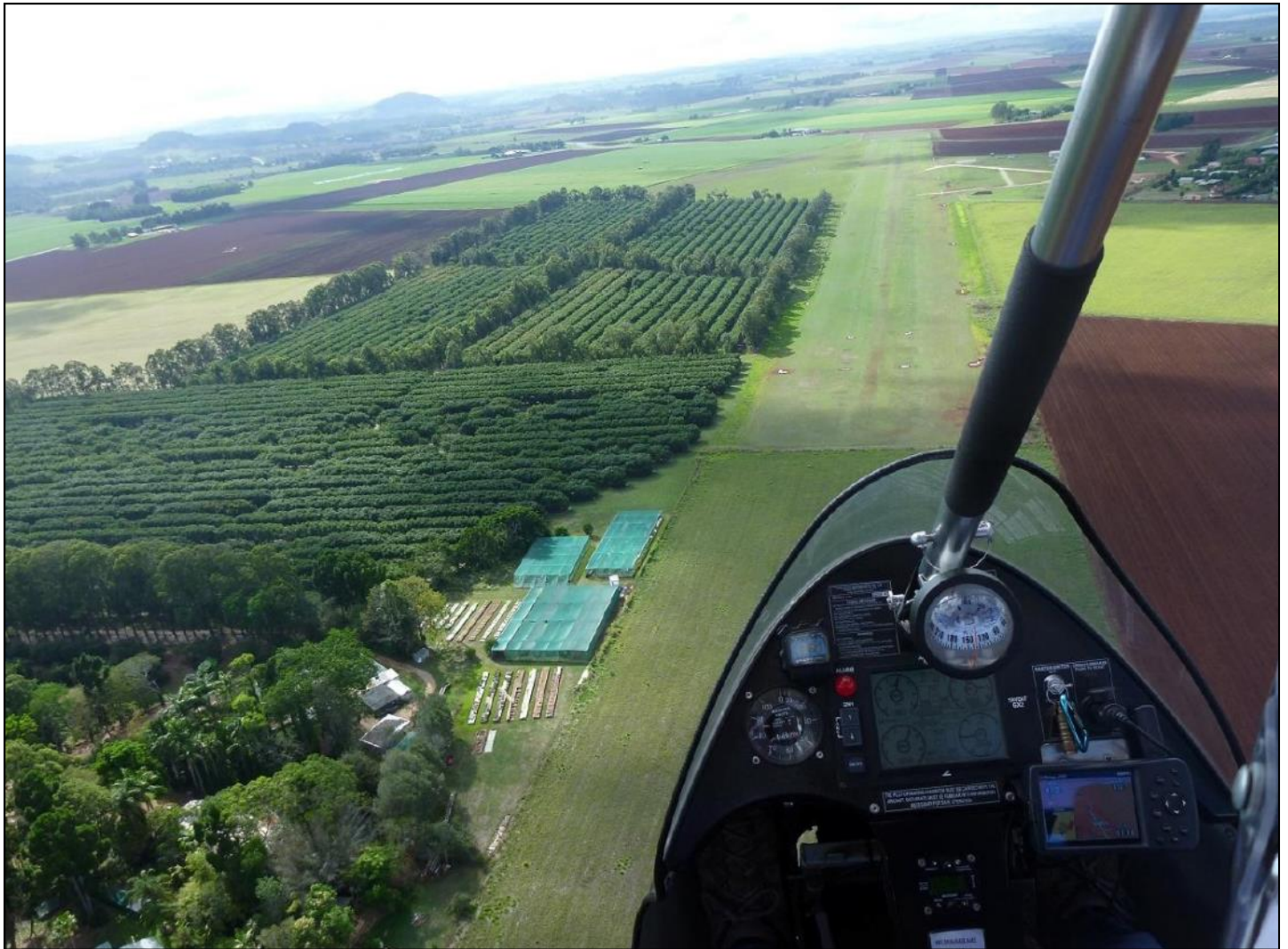
On final at Atherton. An old Photo from 2012.

The Atherton Aero Club is an organization of aviation enthusiasts who promote the sport of aircraft building and flying. The organization is associated with Recreation Aviation Australia Inc. The Club meets at Atherton Airport every third Sunday of the month. Food and drinks are available and visitors are most welcome.