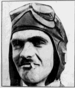
Mr. Guy Menzies, who flew from Sydney to New Zealand in 12 hours 12 minutes, beating Kingsford Smith's record.

Guy Lambton Menzies (20 August 1909 – 1 November 1940) was an Australian aviator who flew the first solo trans-Tasman flight, from Sydney, Australia to the West Coast of New Zealand, on 7 January 1931 (91 Years Ago) .