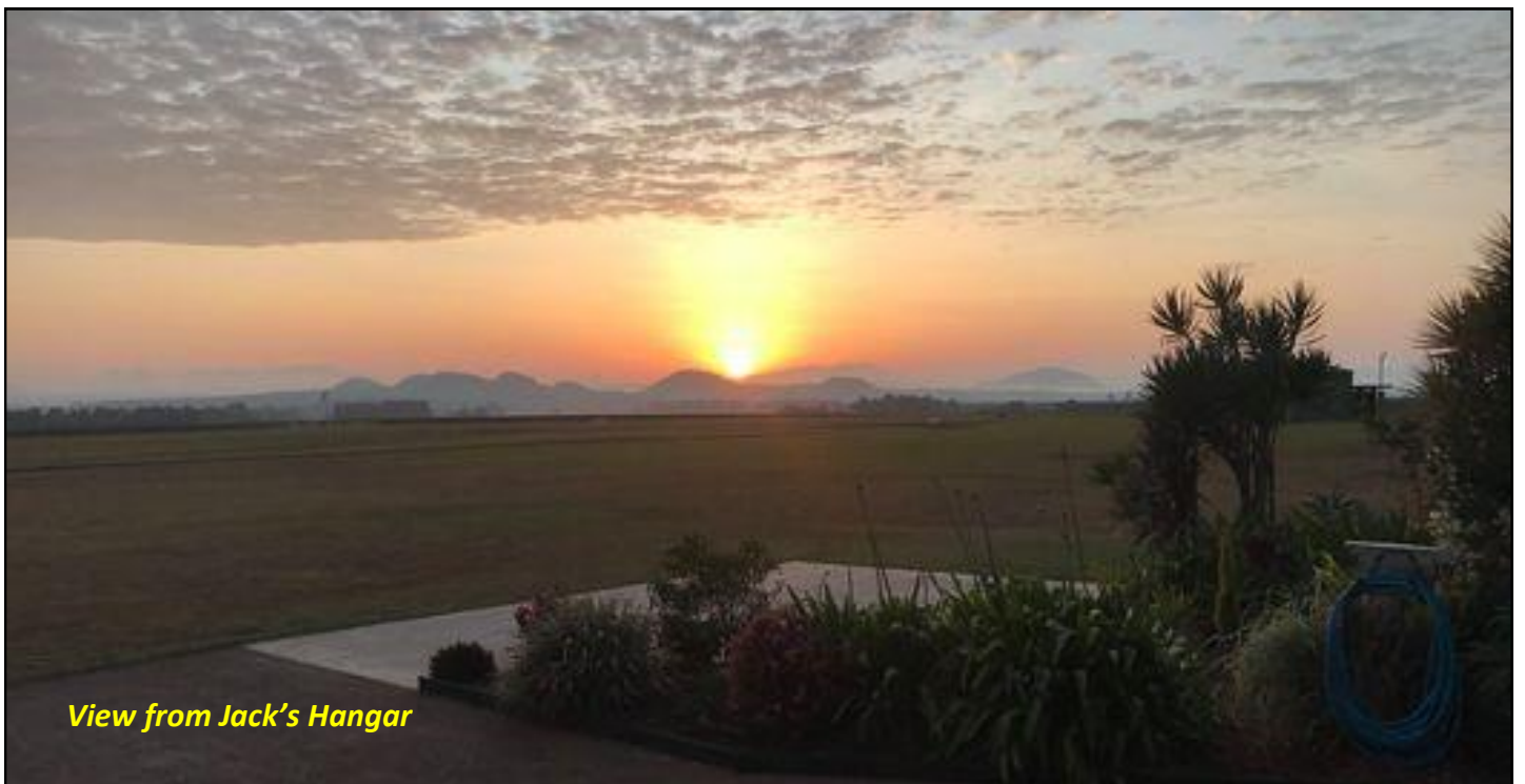
View from Jack's Hangar