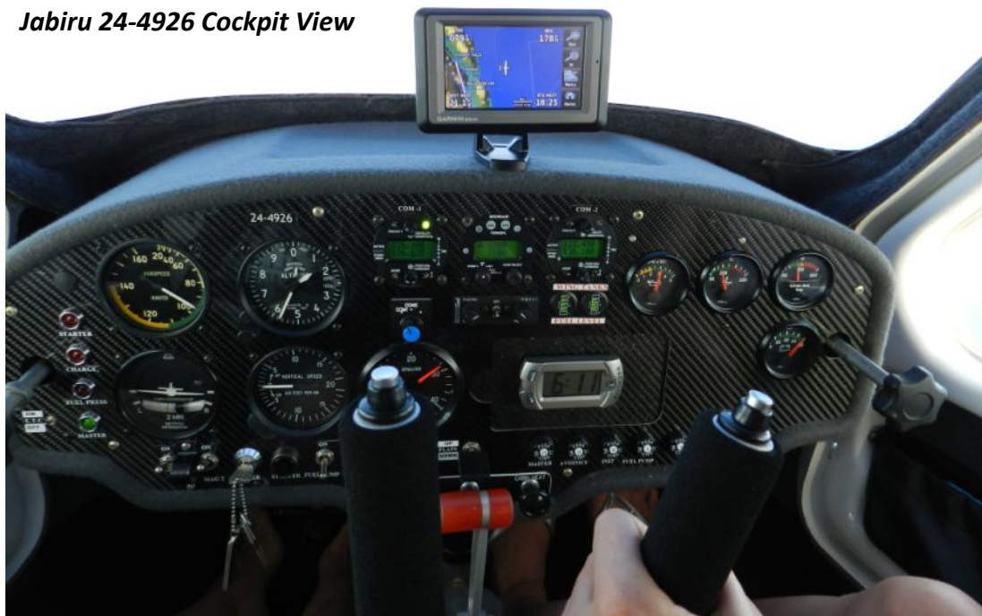
Jabiru 24-4926 Cockpit View

Contact: Jon Collins 0438 634411 or jc4487@gmail.com