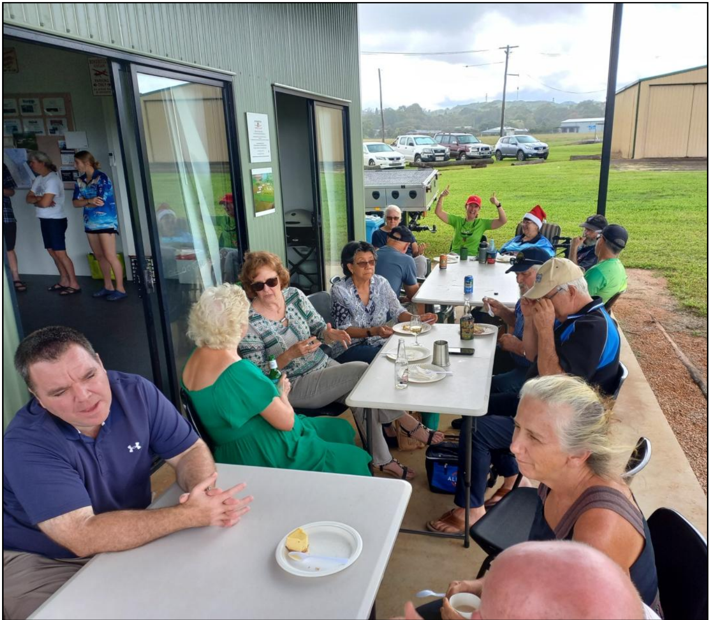
Members enjoying the outdoors at the Atherton Christmas Party.